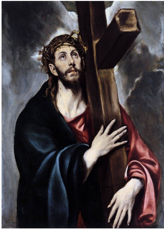
Christ Carrying the Cross El Greco (1541-1614)